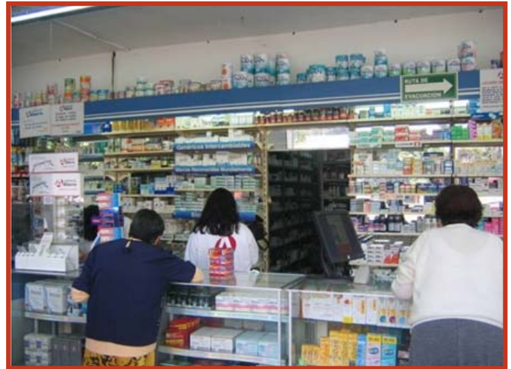
In Latin America, some women obtain misoprostal in pharmacies, like this one in Mexico City, to induce their own abortions.