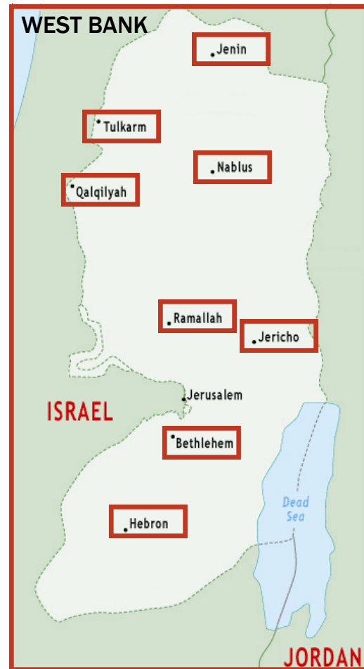
Ibis interviewed pharmacists in the eight West Bank cities indicated above to examine the availability of misoprostol for early pregnancy termination.

about the high rate of contraceptive failure and unintended pregnancy among women. Over three-quarters of the West Bank pharmacists in our study reported that women have come to the pharmacy seeking misoprostol for pregnancy termination and nearly 70% of these pharmacists reported that there has been a considerable increase in requests for misoprostol since the year 2000. Pharmacists reported varied knowledge about the misoprostol regimen for early pregnancy termination. Access to abortion and reproductive health services cannot be separated from the broader context of occupation. However, our study points to several avenues for expanding access to safe abortion services, including misoprostol-only education campaigns targeting pharmacists and clinicians.