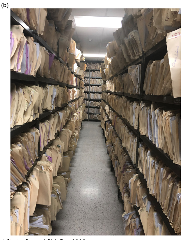
Mena Ugarte. Abortion bans, fetal malformations, and maternal morbidity. Am J Obstet Gynecol Glob Rep 2022.

are employed in the formal sector. More than half (53.1%) of the pregnancies were to individuals aged 24 years or younger with 11.7% being to minors under the age of 18 years. Nearly 40% were first pregnancies, and three-quarters of the pregnancies were unplanned.