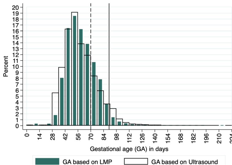
Fig. 1 GA distribution (days) estimated based on LMP and US with cut-offs at 70 and 90 days, overall sample N = 43,219

difference between the two estimations was -0.97 day ( SD = 13.9 ; range = -130 - 165 ).