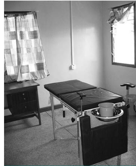
Above: Usher Polyclinic, Ghana— This is one of the new MVA procedure rooms renovated by the YFPAC project. The facility allocated space in a newly built block and Pathfinder complemented this effort by providing new equipment and materials.