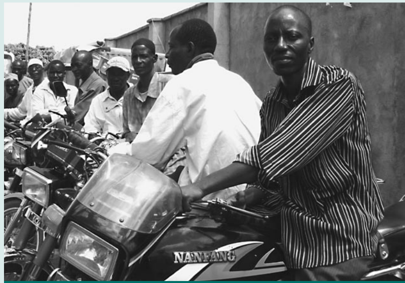
Above: These okada drivers are available to women in the community and know to transport a woman to a WRHC facility if she is bleeding or experiencing complications of an unsafe abortion.

Drawing on experience from the AYA Project, Pathfinder/Tanzania strengthened PAC services for youth in three AYA public sector YFS facilities in Dar es Salaam: Sinza, Tandale, and Buguruni. Support included training service providers in YFPAC, facility assessments, implementation of key quality improvements (e.g., locating contraceptive supplies in/near the procedure room, provision of equipment, and increasing