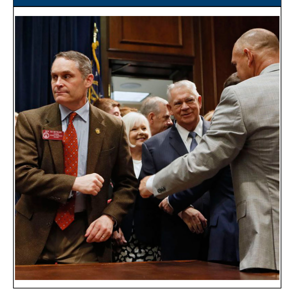
Figure 1. Georgia State Representative Ed Setzler, a sponsor of HB 481 receives a fist bump after passage of the bill.

reproductive health, rights, and justice advocates to understand, analyse, and deconstruct anti-abortion messaging in order to combat it. Public and legislative testimonies are under-utilised to understand anti-abortion policies with little empirical research systematically investigating the arguments, evidence and framing they employ.<sup>21</sup> To our knowledge, no prior studies have examined the legislative discourse surrounding fetal "heartbeat" bans. The purpose of this study was to distinguish and characterise the arguments and tactics used by legislators and community members in support of HB 481, Georgia's early abortion ban.