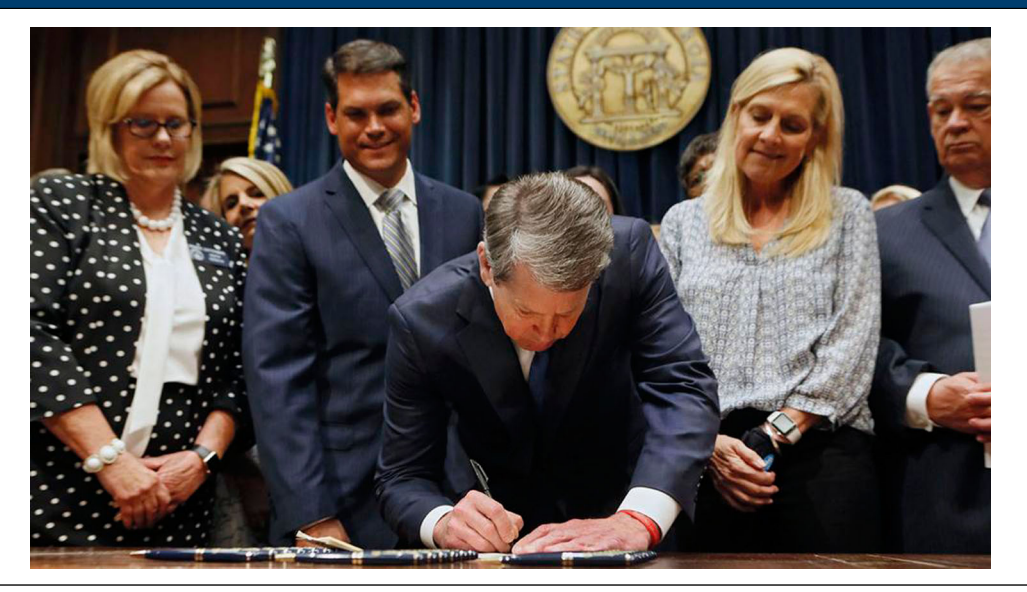
Figure 3. Supporters watch Georgia Governor Brian Kemp sign HB 481 into law on 7 May 2019.

The war on SRHR is happening on both global and domestic battlefields. Anti-abortion activists have